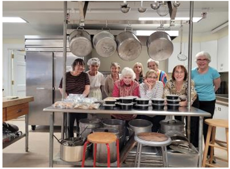
Leah Circle hard at work cooking night to replenish the care team freezer! With deep appreciation!!