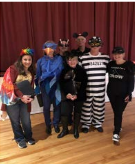
Members of the Feathered Friends Choir