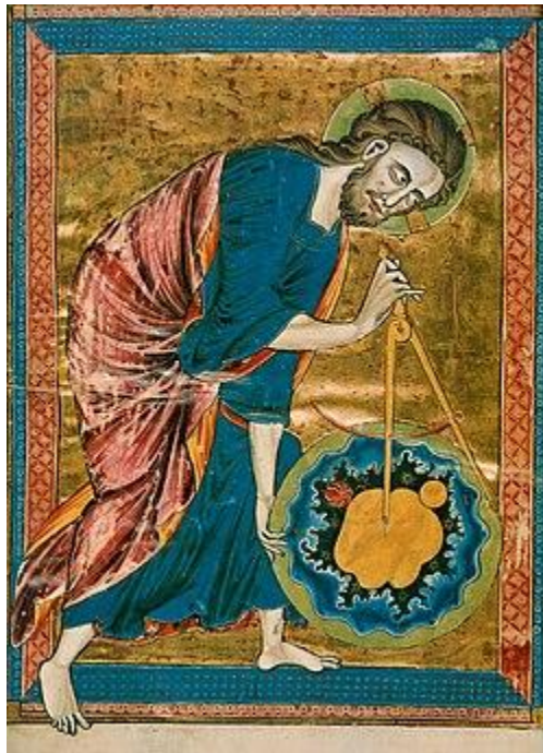
Image: God the Geometer — Gothic frontispiece of the Bible moralisée, France, mid-13th century

An Open and Affirming Congregation of the United Church of Christ