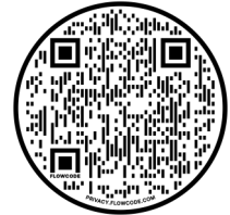
"Like Us" on Facebook